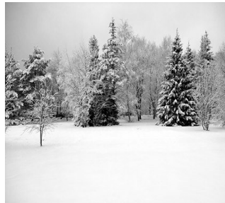
Winter is coming.

We are looking for other professional groups involved in fraud and investigation to network and work